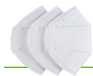
KN 口罩 Masks